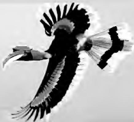
Great Pied Hornbill